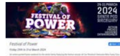
Festival of Power