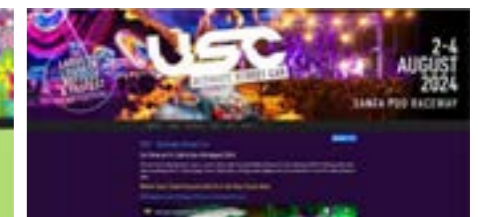
Ultimate Street Car