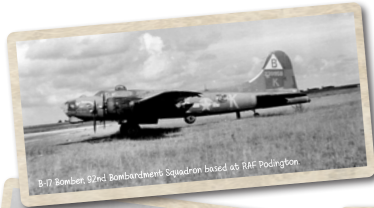
B-17 Bomber, 92nd Bombardment Squadron based at RAF Podington.

As the years roll on, it's hard to believe that Santa Pod Raceway has been organising, running and promoting drag racing events for over 50 years!