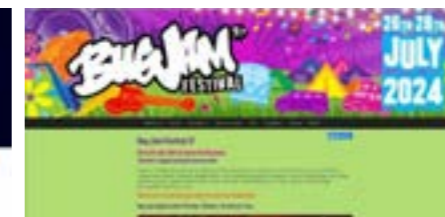
Bug Jam Festival