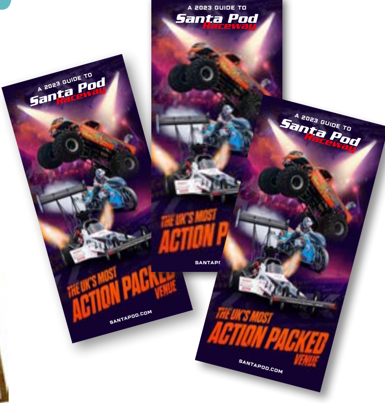
Nitro FM Official Radio Station

£400+vat Full Page: Half Page: £250+vat Quarter Page: £160+vat