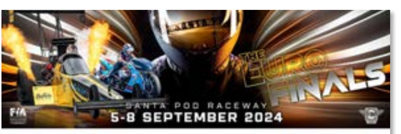
The FIA European Finals